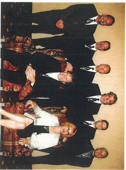
2004 Fellows in St. John's